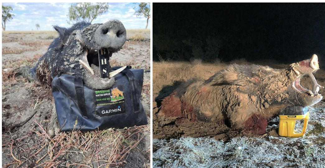
Fig. 1 and 2: Wild boars displayed using a brag stick (left) and a tree branch (right)

We have shown that available evidence suggests that these objectives are not and cannot be achieved by recreational hunting. For example, if a hunter kills a wild animal whose likelihood of survival is low, this allows others of the same species to survive by reducing their competition for limited resources. 102 This is further compounded by the deliberate acts of some hunters. In some cases, evidence has demonstrated that pig hunters have illegally translocated pigs 103 and deer 104 into new areas for the purposes of recreational hunting. Despite this practice being identified in the threat abatement plan ('TAP') for predation, habitat degradation, competition and disease transmission by pigs 105 , the Department has proposed to replace the existing penalty regime associated with the deliberate release of an animal with a monetary fine.