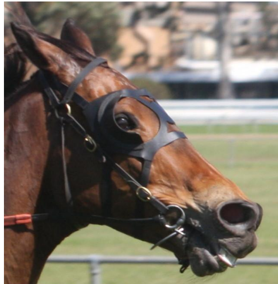
This jumps horse is being vigorously whipped and his distress is obvious - he has his tongue jammed between his teeth