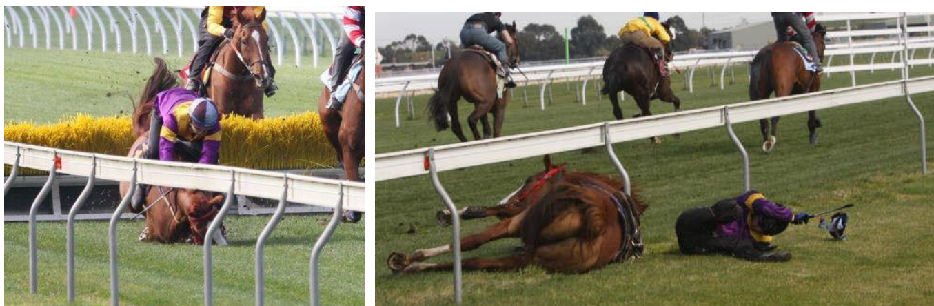
An example of the potential for cranial and vertebral injuries. Picture taken September, 2008 at Cranbourne trials.

These statistics provide clear evidence that jump horses are pushed far beyond their natural limits, and are subjected to much greater musculo-skeletal (limb, head and back injuries) and physiological stress than their flat racing counterparts.