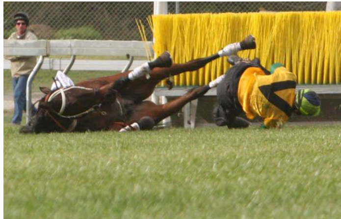
Horse falling at “jumps trials”

Spanish Symbol was one horse who died in the 2008 season after falling and fracturing a leg. A demonstration at Moonee Valley by some 20 activists resulted in the taking of this picture where he was found dumped at the back of the track under a tarpaulin. Ironically shortly after several police arrived to “guard” his body from horse advocates who were campaigning to ban jumps racing and protect him from the horrific cruelty he suffered.